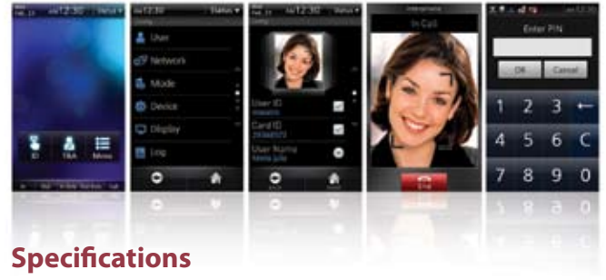
Intuitive Touchscreen GUI of BioStation T2